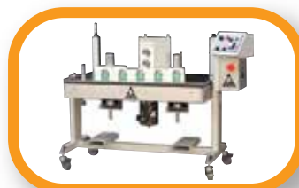
Invertible 90 degree Table Top Rewinders