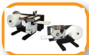
Unwind and Rewind Modules