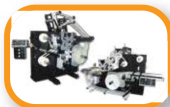
Slitter/Rewind Inspection Machines