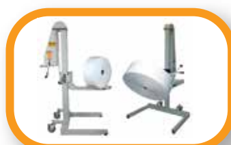
Roll Handling and Die Lifting Equipment