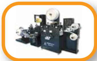
Modular Rotary Die Cutting and Finishing Systems