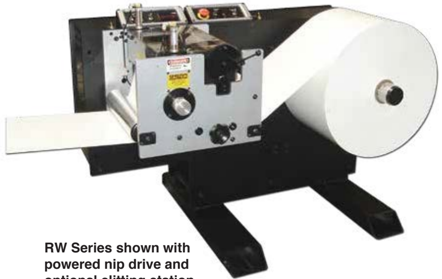
RW Series shown with powered nip drive and optional slitting station

The AzTech RW Series of Large Roll Rewind Modules are an invaluable component for today's competitive and demanding printing and converting industry. The RW Series are available with constant torque, powered nip drive, or dancer-controlled constant tension giving them the ability to run in tandem with your existing printing and converting equipment