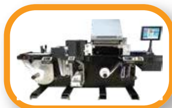
High-Speed Digital Printing Systems