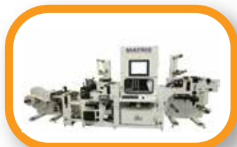
Modular Laser Cutting and Finishing Systems