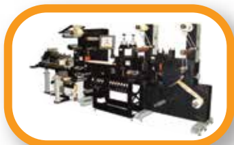
Booklet Onserting and Diecutting Systems