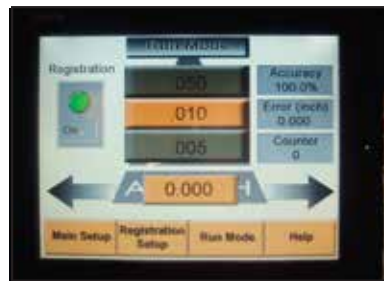
Touch-screen operator control panel for precise and easy adjustments.

The DieMaster RR Series is a servo-driven modular system that combines productivity, versatility, and operator efficiency all at an attractive price. The DieMaster is extremely versatile in that it can convert a wide variety of substrates from thin, unsupported films to thick synthetic and gasket materials, and can be configured to perform numerous converting tasks such as Re-registration Die-Cutting, ECL/Coupon Label Converting, and Digital Post-Press Die-Cutting and Sheeting.