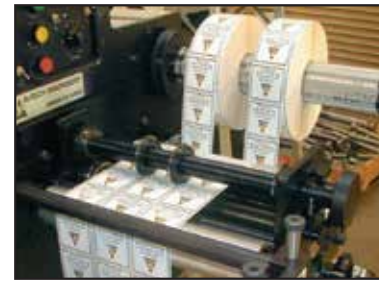
Finished roll dual-rewind spindles and slitting station shown with rotary shear knives. Also available with pneumatic rotary crush knives, and razor slitting.

For nearly 30 years AZTECH Converting Systems has provided innovative equipment solutions to the printing and converting industries.