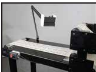
Inspection Table for Imprinting & Inspection Equipment