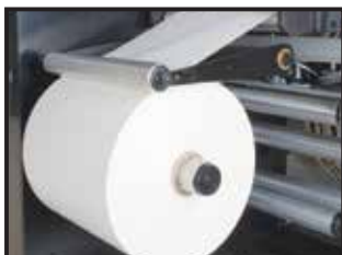
Pneumatically Activated Top Rider Rolls for Unsupported Film and Large Diameter Rewinding

For nearly 30 years AZTECH Converting Systems has provided innovative equipment solutions to the printing and converting industries.