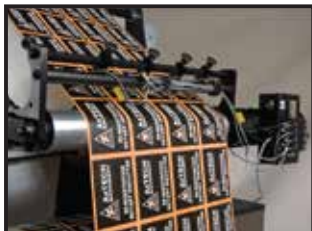
Electronic Missing Label and Splice Detection