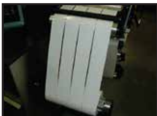
Spread-Roller for Separating Finished Rolls at Rewind