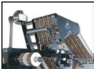
Forward Inspection Tower with Synchronized Strobe