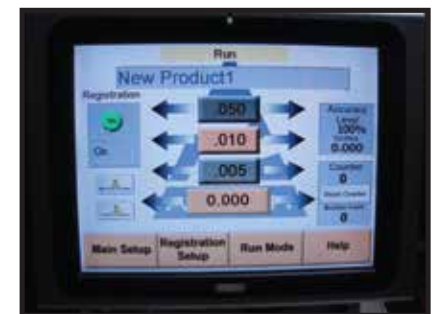
User-Friendly Operator Touch-Screen