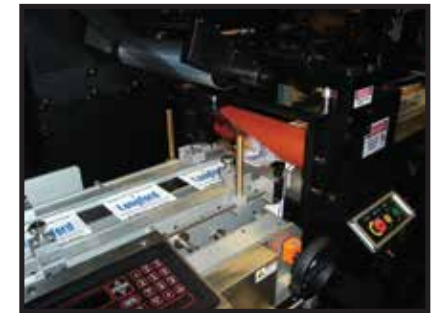
Pneumatic Nip for Sealing Booklets to Web.