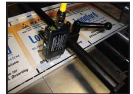
Electronic Web Sensor for Precise Registration and placement