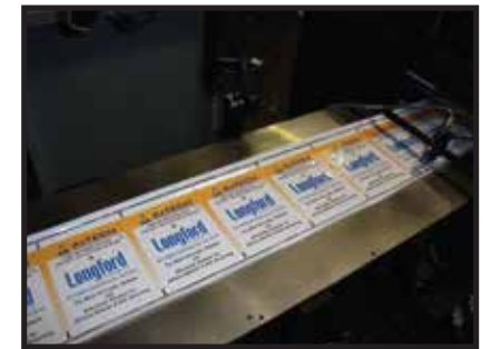
Operator Inspection Table